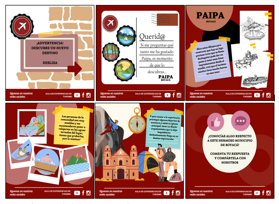
Figure 2. First Instagram Publication: Aula de Experiencias en Turismo "For our first trip in this section, we introduce you to Paipa. A municipality located in the department of Boyacá"