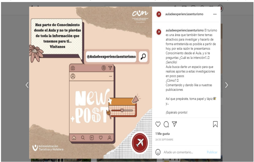
Figure 1. Expectation Campaign Tourism Experiences Classroom "Tourism is an area that also has attractive topics to research, and doing so in an entertaining way is possible starting today"